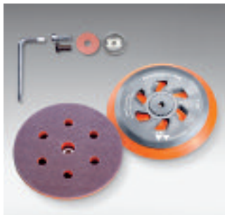
Aerodynamic pad T7207.0000.1 extra soft incl. star shaped adapter 5/16" + M8

sia Abrasives Industries AG CH-8501 Frauenfeld/Switzerland www.sia-abrasives.com sia.ch@sia-abrasives.com