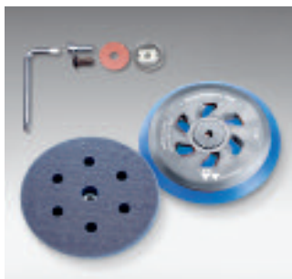
Aerodynamic pad T7206.0000.1 soft incl. star shaped adapter 5/16" + M8