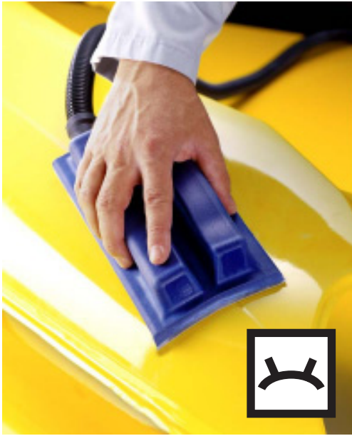
Sanding on convex parts