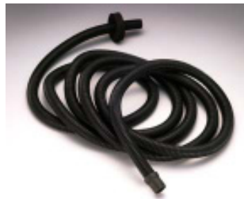
Suction hose T8592.0000.1